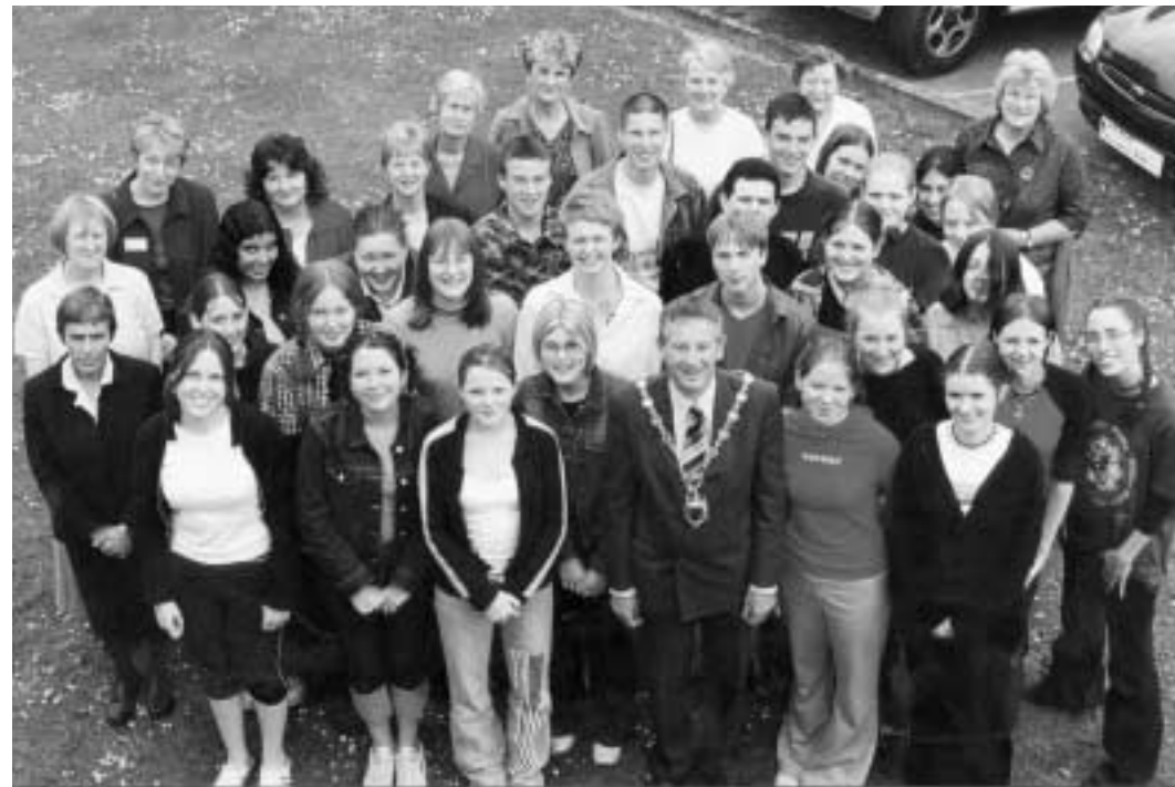
6th Form Volunteers supporting charities and schools, with representatives of the organisations they helped.

Thurs 23.30: To Ferrybridge in Humberside to meet coach, then via various stops around the country to Dover. Ferry to Calais early evening. I hate the sea! Friday 21.00: Arrive hotel. Check in, then the weighing in, and at last bed Sat 06.30: Early alarm to make bed and tidy up before breakfast Sat 08.00: Discover what time my particular weight category is on. 1,500 competitors, so it could be at any time in the day. Hope it's early so I don't have to hang around all day. Hope I do well: it's awful to think you've come all this way and then go out early Sat 18.15: Competition finally starts for me. Ten hours just hanging around – but it goes well. Sat 20.00: Back on bus/ferry. I hate buses – but if I get into the senior squad I'll fly to competitions! Sun 07.00: Arrive back in Kendal. Is it worth it? Yes!!